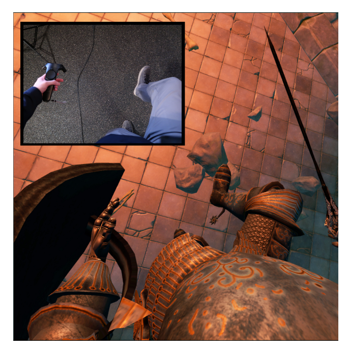
Figure 2: A first-person perspective of the user looking down at their virtual body. The inset shows the user's actual body.

When a user is ready to begin the experience, they perform a simple one-button calibration and their virtual body appears inside the virtual environment. As the user moves around and explores different virtual spaces, their virtual bodies will react to their movements. Looking down, the user will see a virtual body instead of their own, where each virtual body part moves and rotates in synchrony with the user's (actual) body (Figure 2). During their experience, the user can perform physical gestures and interact with virtual objects using any part of their body. Such interactions include crouching, dodging, waving, kicking, pushing, grabbing, throwing or any other gesture using physical movement. The user will be able to try out different avatars within these virtual spaces, such as a becoming a knight in a castle (Figure 2) or a futuristic space explorer (Figure 1: Right). Within each environment, the user will be able to see a reflection of their avatar through a mirror in the environment. Each user is expected to try the demo for 1-5 minutes.